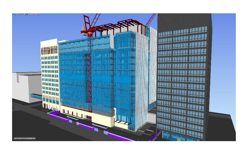
Exterior Wall Cladding December 2017